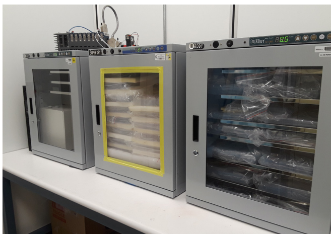
FIG. 1. Three dry boxes located in Experimental Equipment Lab.

The performance of the aerogel tiles used in the RICH detector deteriorates in humidity environments greater than 5% RH. To ensure that the tiles are always in a humidity environment less than 5% RH, they are stored in three dry boxes located in the Experimental Equipment Lab, Fig. 1. Manufactured by XDry, the boxes use a desiccant to maintain the selected humidity level, in the range of 1–50% RH.